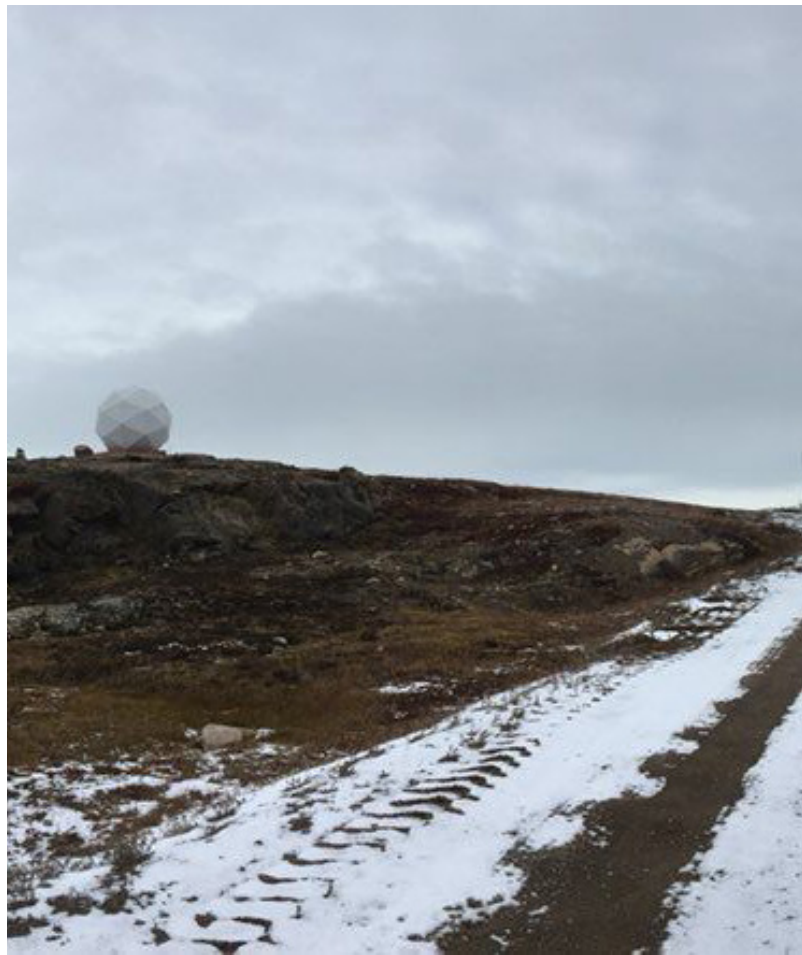
Airport communications installation in Iqaluit, Canada // Michael Delaunay

Planned: Phase 2 will aim to connect Alaska to Japan by 2020. Phase 3 is expected to connect Alaska to the United Kingdom with possible landing sites in the Canadian Arctic.