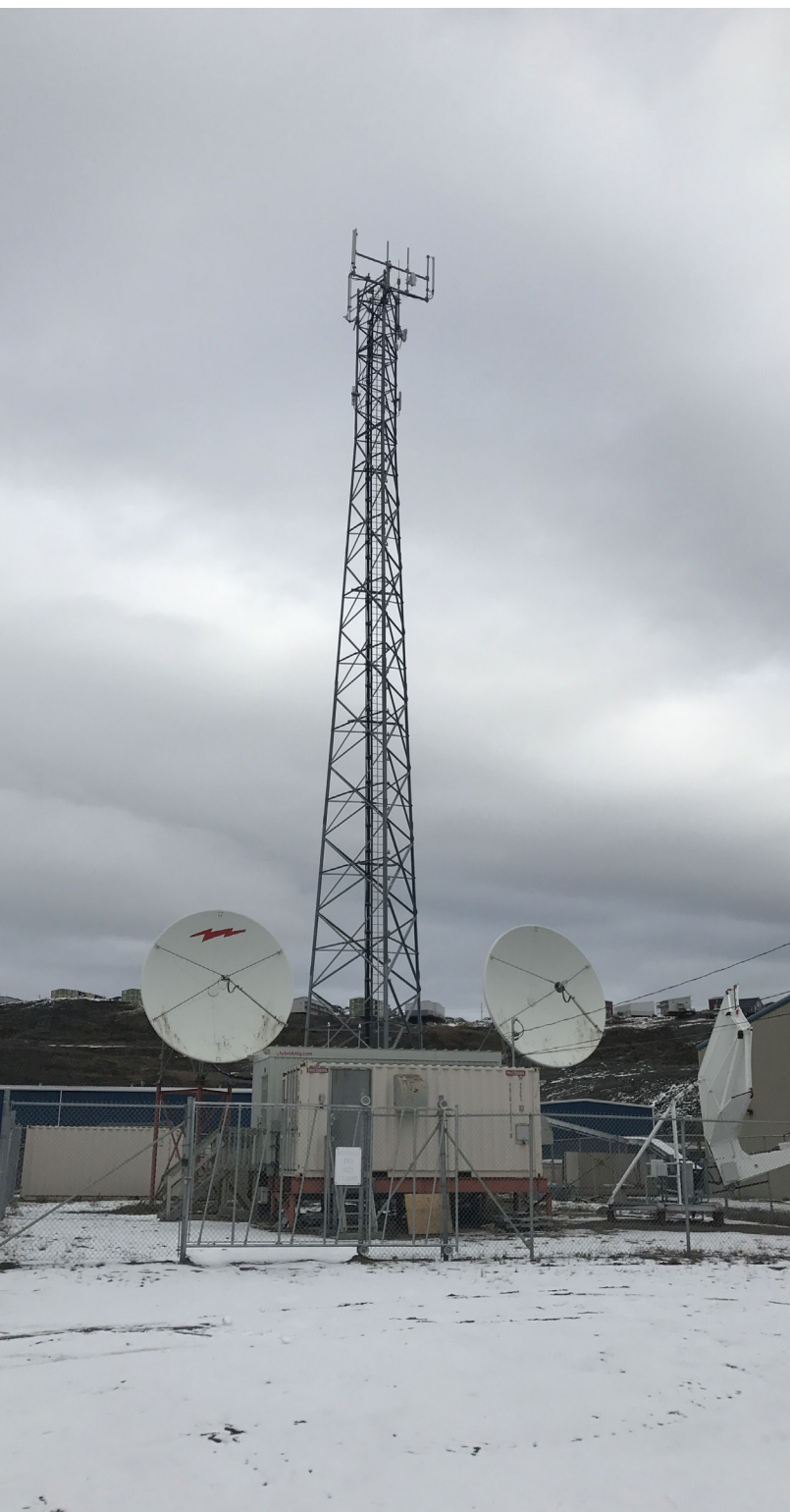
Antenna and satellites in Iqaluit, Canada

COMPANY NAME: Russian Satellite Communications Company (RSCC)